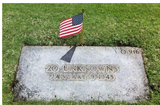
(L) One of the graves of the Enoura Maru men at the Punchbowl.

It has been a long and hard struggle, and by working together with the ADBC-MS we have finally been able to realize our dream, and that of the families of the Enoura Maru men - to have this very fitting memorial stone placed on the Walk of Remembrance in their honour. They will not be forgotten!