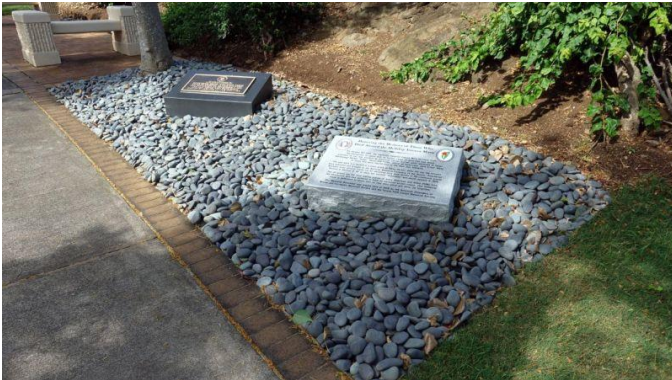
The Enoura Maru Stone on the Memorial Walk at the Punchbowl Cemetery in Hawaii.

The Official Newsletter of the TAIWAN P.O.W. CAMPS MEMORIAL SOCIETY