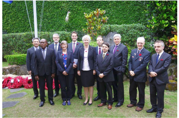
Wreath layers at the Anzac Day service.