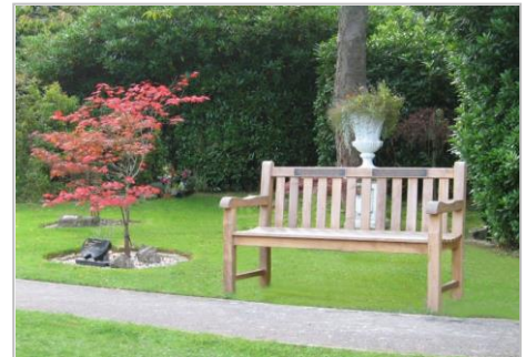
The original wooden bench.

In the years that followed, with the weather and the fact that the bench was only meant to last ten years, it was decided to replace the wooden bench with one made of granite and which would remain there in perpetuity to honour and remember the men. Working with the crematorium staff once again, arrangements were made and a beautiful granite bench was procured and installed in July 2018.