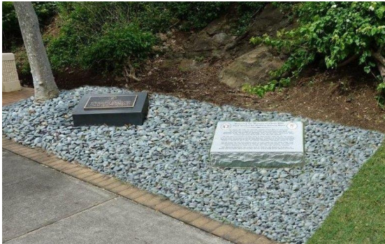
The Enoura Maru Stone on the Memorial Walk

During my stay in Hawaii I met a lot of folks at various places, and whenever they would ask what I was doing there, I would share the story of the Taiwan POWs, the Enoura Maru tragedy and our mission to make sure that the men were remembered. Those I talked with were both interested and fascinated in what I had to say, and it was rewarding to see their response knowing that a bit more of the Taiwan POWs' story was now better known to them.