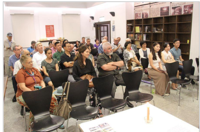
The 48 guests who came out to the event.

This excellent film, directed by Academy Award-winning Australian Bruce Beresford, told the story of the civilian women - including the Australian nurses, who were captured by the Japanese in Sumatra and how they formed a choir to help overcome their situation and torment and survive. Based on a true story, it accurately portrayed the brutality shown even to women and children by their Japanese captors. It also shows how they triumphed over their adversity.