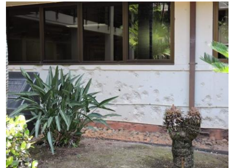
Hickam AFB HQ still bears the scars of the December 7th strafing.

So, on arrival at Honolulu airport, Tony picked me up and we went for a visit to Hickam Air Force Base and the Pearl Harbour Navy Base. At Hickam we saw where the Japanese had strafed and bombed the hangars and buildings - the bullet and shrapnel holes are still in the walls of the buildings as they have been since that fateful day of December 7th 1941. We toured the base and saw a number of aircraft, and then we visited the naval base and the submarine base and saw various types of ships. Then over to Ford Island where the main Japanese attack on battleship row and the air base took place. We viewed the USS Oklahoma Memorial and the Ford Island Control Tower which can be seen in all the movies, along with the hangars which still had bullet holes through the windows of the hangar doors. It was really a step back in time and one got the feeling of what it must have been like to be there on that fateful Sunday morning. It was a fitting beginning to a wonderful week of learning and remembering. My thanks to Tony for a great day.