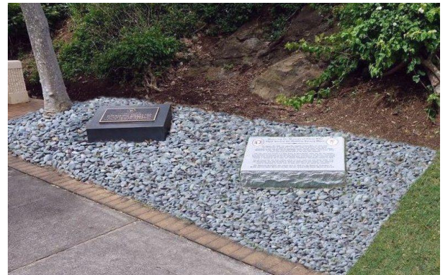
The Enoura Maru Stone on the Memorial Walk at the Punchbowl Cemetery in Hawaii.