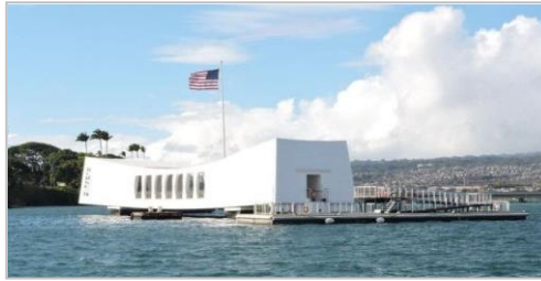
The USS Arizona Memorial