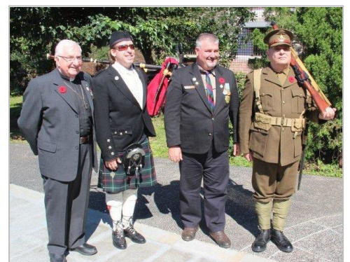
2018 Remembrance Day Service - marking one hundred years since the end of WWI. (See story on page 8)