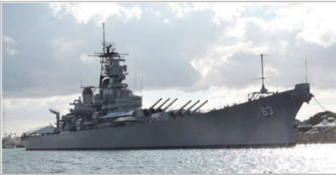
The Battleship USS Missouri BB-63

Then it was over to the Pacific Air Museum, and having worked in aviation for a number of years and loving airplanes, I was in another world for a couple more hours. The two hangars of the museum contain a number of historic World War II aircraft and excellent dioramas, as well as a range of more modern jets and helicopters.