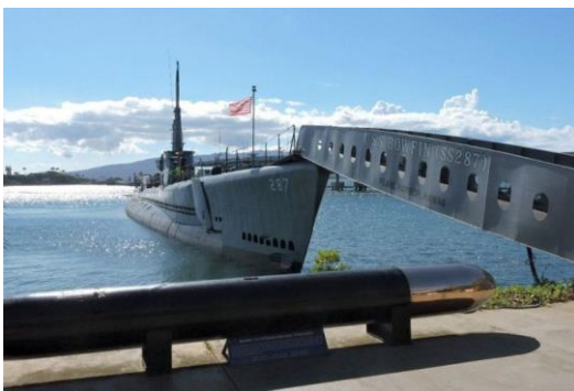
USS Bowfin – SS-287

The following day, Thursday the 16th at 3:15pm, our group was treated to a specially arranged boat tour around Ford Island. Prior to meeting the group at 3 pm I decided to go to the 'World War II Valour in the Pacific' Centre and visit the USS Bowfin submarine and Museum, and also the USS Arizona Museum. I got to thoroughly explore the sub and took some wonderful photos. It was a sub like this - the USS Sealion II , that had torpedoed the hellship Rakuyo Maru on which my two Australian uncles died in September 1944. After lunch I visited the USS Arizona Museum and then met our group for the tour.