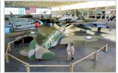
The Pacific Air Museum