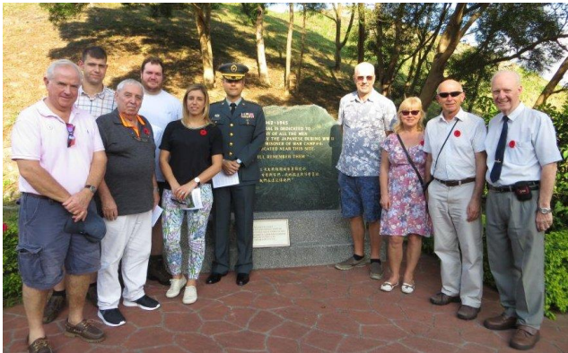
With MND Admin Staff at the Taihoku # 6 Memorial.

Friday, our guests enjoyed some local sightseeing - a Chinese temple, the Lin Family Chinese home and gardens, and then the sumptuous buffet lunch at the famous Grand Hotel before proceeding to the National War Memorial to see the changing of the guard. Following this we made our way to Taihoku Camp #6 for a visit and memorial service.