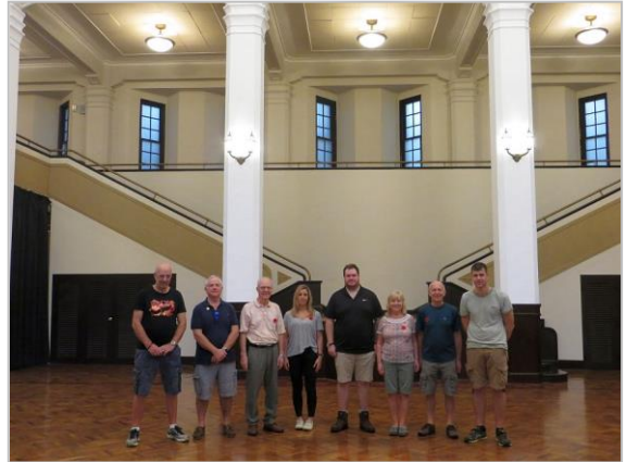
Inside the Zhongshan hall – 11am, November 11th

A tour of the hall and the surrender chamber were arranged and we had the rare and unique opportunity to observe Remembrance Day exactly on the 11th hour while inside the historical former chamber. It was an experience that won't soon be forgotten.