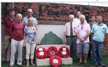
The group by the newly dedicated memorial.

Then British POWs arrived in late 1942 and remained til June 1944. We want to remember all of these men with this memorial.