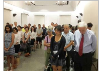
Part of the crowd remembering the POWs