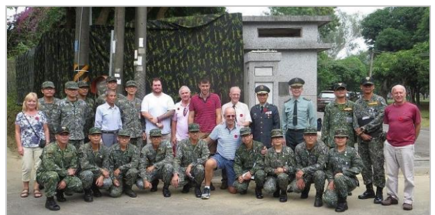
With MND personnel at the Shirakawa Memorial.

From Taichu we moved on to the former Shirakawa Camp at the Nei-jiao Military Base near Bai He. We were warmly welcomed by the base commander and an interested and attentive group of soldiers, and after a walk about of the former POW camp site, a meaningful service of remembrance was held.