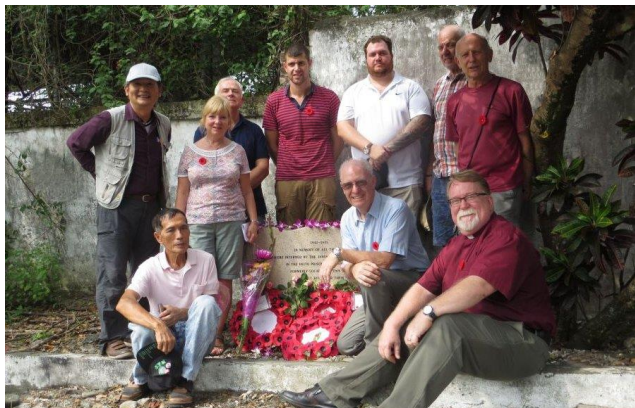
The group by the Heito Memorial after the service.

Following our time at Shirakawa we drove down to PingTung where we spent the night before going to Heito Camp the next morning. On the way to the camp we stopped once again at the old Taiwan Sugar Co. factory where many of the former POWs worked. After a walk about in the former camp site, a memorial service was held. In attendance once again was one of the former camp guards, now 96 who warmly welcomed our visitors.