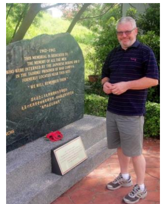
Right : Remembering his father at the Taihoku Camp 6 Memorial in Taipei.

We are always so pleased to have these visitors with us!