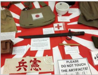
Wartime artifacts On display