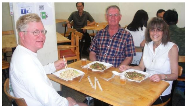
Happy guests enjoying a typical Taiwanese lunch.

The Taiwan POW Camps Memorial Society is honoured to have been chosen by Valor Tours – one of America's oldest, best and leading battlefield and memorial tour companies, to host their clients on a tour of some of Taiwan's POW sites.