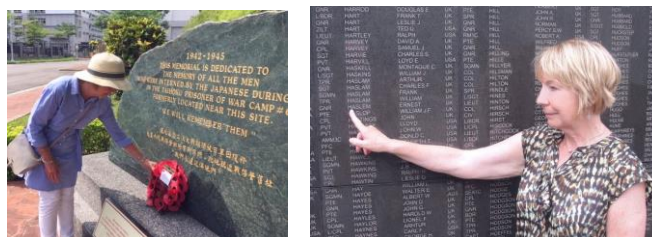
Laying the wreath on the T6 Memorial and touching her dad's name on the Memorial Wall at Kinkaseki.

The next day we visited Kinkaseki Camp and the POW Memorial Park, and once again she was moved as she touched her father's name on the wall. Although her dad was never sent to Kinkaseki, she was pleased to learn of its story and the conditions that so many of her dad's mates had experienced there.